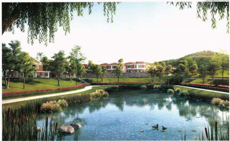
An artist's impression of one of the three lakes

Upon its completion within 10 years, the town-