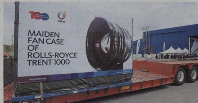
UMW Aerospace manufactures fan cases for Trent 1000 TEN and Trent 7000 aero engines before supplying them to Rolls-Royce's aircraft engine assembly plant in Seletar Aerospace Park

The government is expected to reveal the aerospace 2018 performance next week, in conjunction with the opening of the Langkawi International Maritime and Aerospace Exhibition slated on March 26-30, 2019. For now, the industry looks bright and could be a game changer to the country's old economic model.