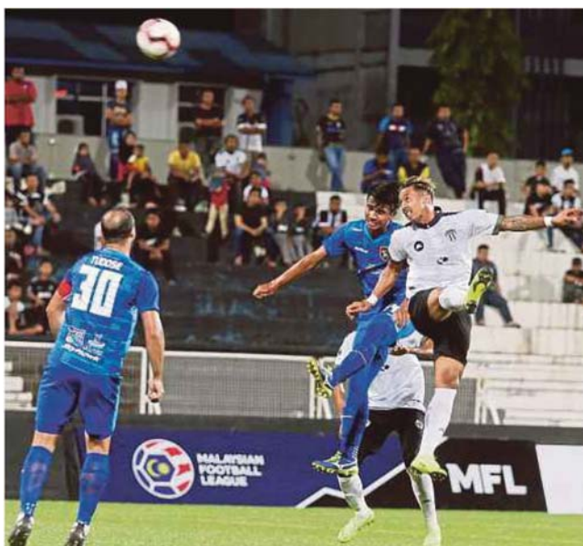
Malaysian Football League have decided to cancel an eight-year sponsorship contract with Telekom Malaysia worth RM480 million.

directors' decision to end the contract with TM and although it was shocking, Perak trust MFL will do its best to find a solution with another sponsor," he said.