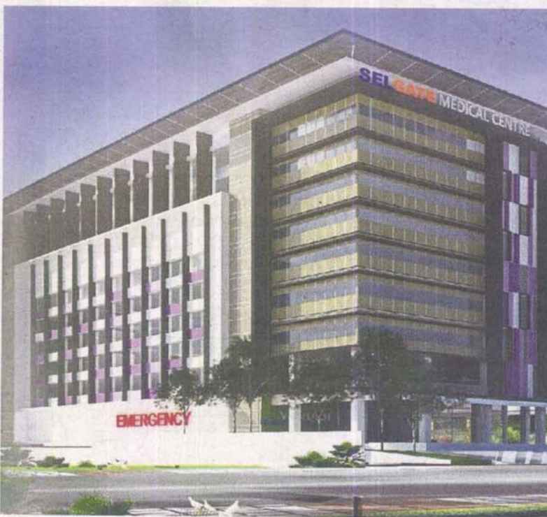
An artist's impression of the Selgate Setia Alam Hospital to be built in Precinct 10, Section U13, Shah Alam.

"It is timely for Selangor to venture into healthcare and this is a strategic move by the state.