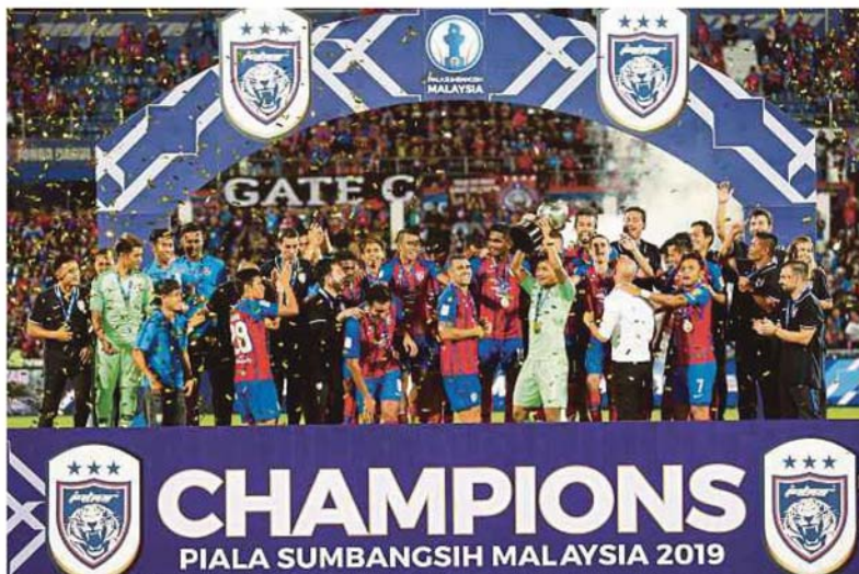
Johor Darul Ta'zim celebrate winning their sixth Charity Shield after beating Perak 1-0 at Larkin Stadium in February.