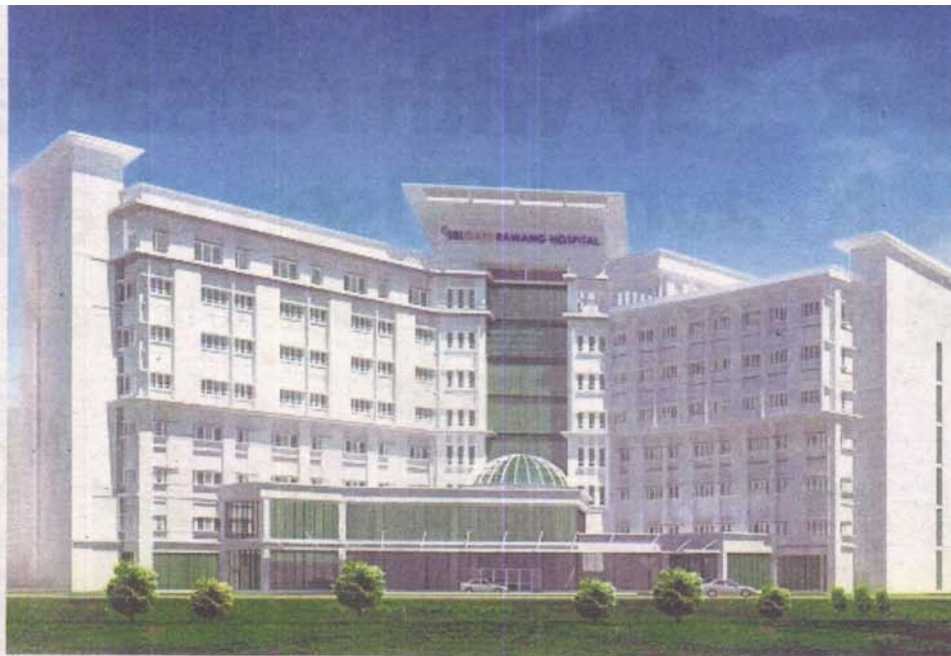
An artist's impression of Selgate Rawang Hospital being built at Persiaran Anggun in Sungai Bakau.