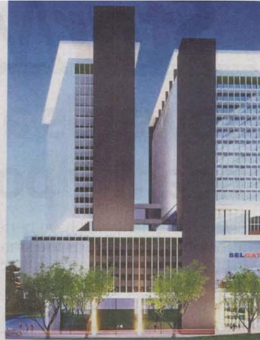
An artist's impression of Selgate Kota Damansara Hospital which will be in Section 3, Selangor Science Park, Petaling Jaya.

like a community hospital with a women and children centre.