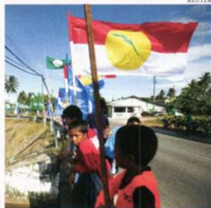
Umno and PAS need something tangible to show their alliance is more than just a marriage of convenience

Another name, I suppose, would be UG, for unity government. UGs have been much talked about since BN/Umno lost the Selangor state government in 2008.