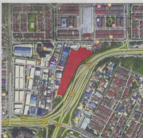
Selgate Gombak Hospital will sit on 0.9ha of land and have 150 beds, catering to the densely populated town of Gombak.