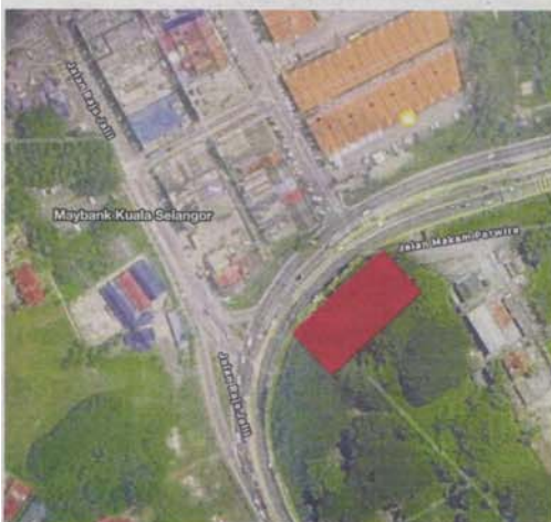
Selgate Kuala Selangor Hospital will be at Jalan Kuala Selangor. This proposed site is along the federal road connecting Teluk Intan to Kapar, providing easy access to residents in Sekinchan, Tanjung Karang and Kapar.

"Johor has its own private healthcare arm and Melaka has Putra Specialist Hospital," she said, adding that other state government agencies such as Majlis Agama Islam also owned shares in private hospitals in the country.