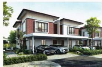
Artist's impressions of Clover (above) and Avis 1 (below)