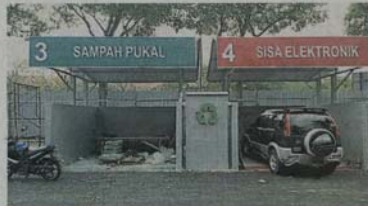
市政厅已进行妥善规划和分类，方便民众到该处丢弃大型垃圾 (Sampah Pukal) 和电子废料。