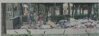
一堆堆的“垃圾山丘”，成为垃圾堆成为拾荒者“寻宝”的天地。

记者向资源回收站对面住宅区一间托儿所的巫裔家长了解，该资源回收站经常出现来历不明的“寻宝人”。