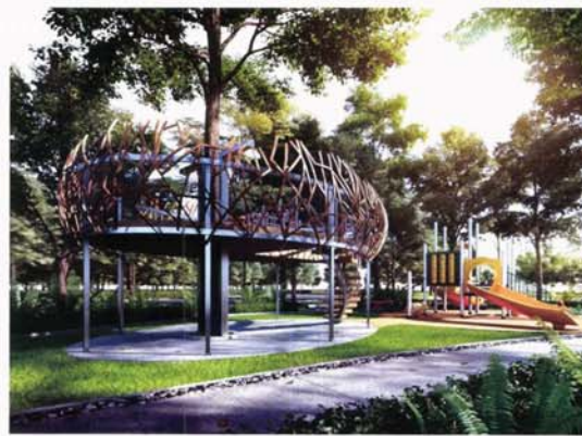
New amenities such as a jogging track, a treehouse for children, fitness stations and a water pavilion will be available in Setia Alamsari

ship will have 6,500 units with an estimated population of 26,000, on the basis of four persons per household.