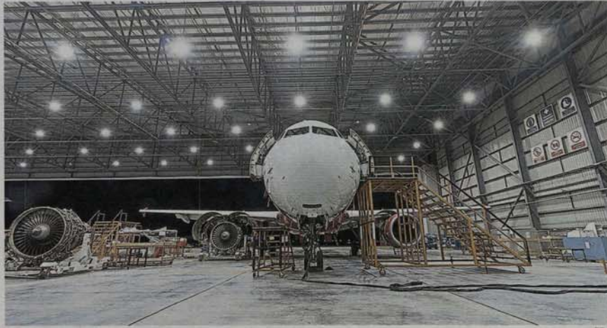
SAE — a wholly owned subsidiary of Airbus Group — employs less than 2% of expatriates in its MRO facilities

According to the National Aerospace Industry Coordinating Office (Naico), a unit under the Ministry of International Trade and Industry, there are about 230 players within this highly technical, but lucrative business chain.