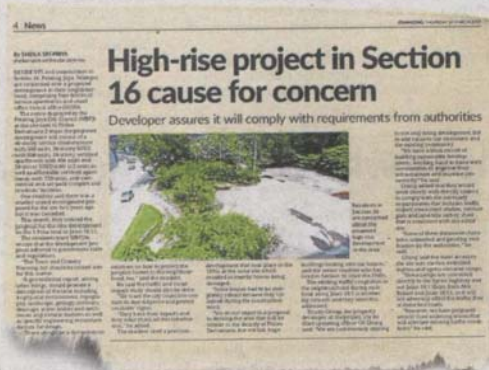
StarMetro's report on March 14.

"The developer has his own traffic impact